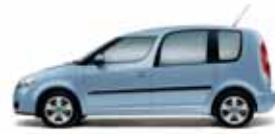
Polar Blue metallic*