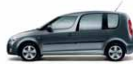
Anthracite Grey metallic*