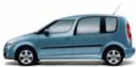
Satin Grey metallic*