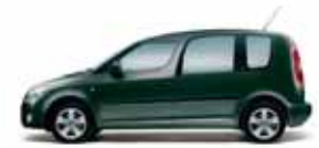
Amazonian Green metallic*