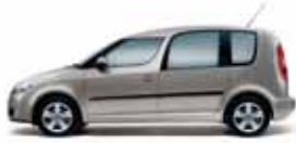
Cappuccino Beige metallic*