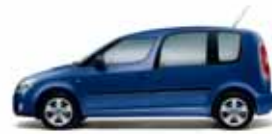
Storm Blue metallic*