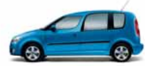
Ocean Blue metallic*